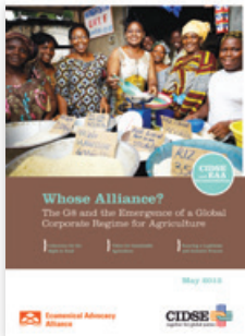
Whose Alliance? The G8 and the emergence of a global corporate regime for agriculture CIDSE and EAA recommendations

CIDSE has a strong tradition of publishing policy papers, reports and statements which are highly valued by decision and policy makers and journalists alike, as well as those within the CIDSE network and the wider development community. The following are a few key publications from last year: