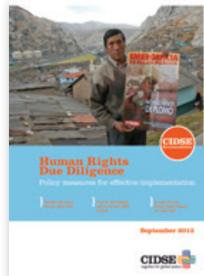
Human Rights Due Diligence Policy measures for effective implementation CIDSE recommendations