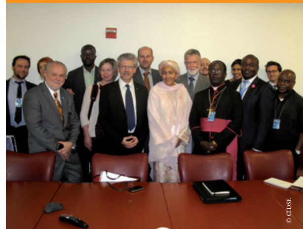
Delegates with Anima Mohammed, UN Special Advisor on Post-2015 Development Planning

Time and time again CIDSE has stressed that human dignity and respect for human rights must be central to future goals and that they need to address the structures of our financial system as well as climate change. Our delegations to the UN and EU and our work at the World Social Forum have reinforced the voices of our Southern partners, and “sustainable development” is, today, at the heart of all the thematic areas we are engaged in. Current political discussions on a new post-2015 framework and SDGs, as well as growing awareness that business-as-usual is not working, give us the chance to promote our vision.