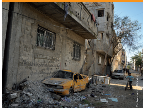
Gaza residential area affected by the November 2012 aerial bombings

Given the EU's commitments to promote respect for international humanitarian and human rights law, as well as its influence as a major donor to the Palestinians and trading partner of Israel, there is still a range of actions it could take to address violations on the ground.