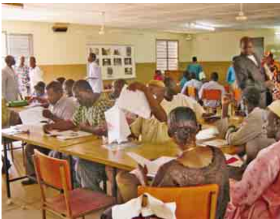
Stakeholders divided into two groups discussing the scenarios during the final workshop on strategic FSM planning in Ouahigouya, Burkina Faso.

these results, we chose the involvement approach consisting of focus group discussions and all-stakeholders workshops. During the final workshop, the entire involvement process was evaluated by the stakeholder themselves through a questionnaire.