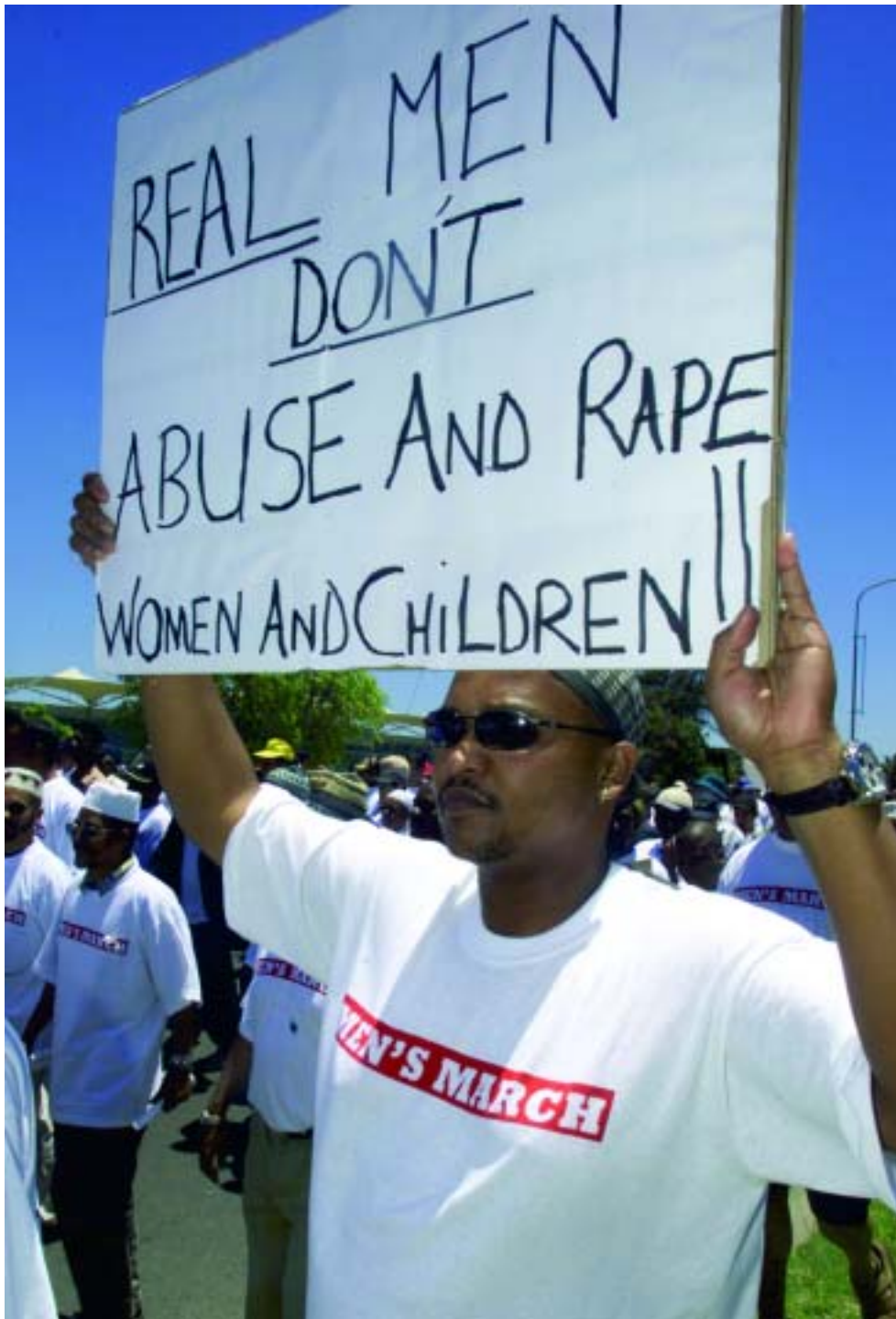
Marchers demonstrating in Cape Town, South Africa, about violence against women and children, November 2001.