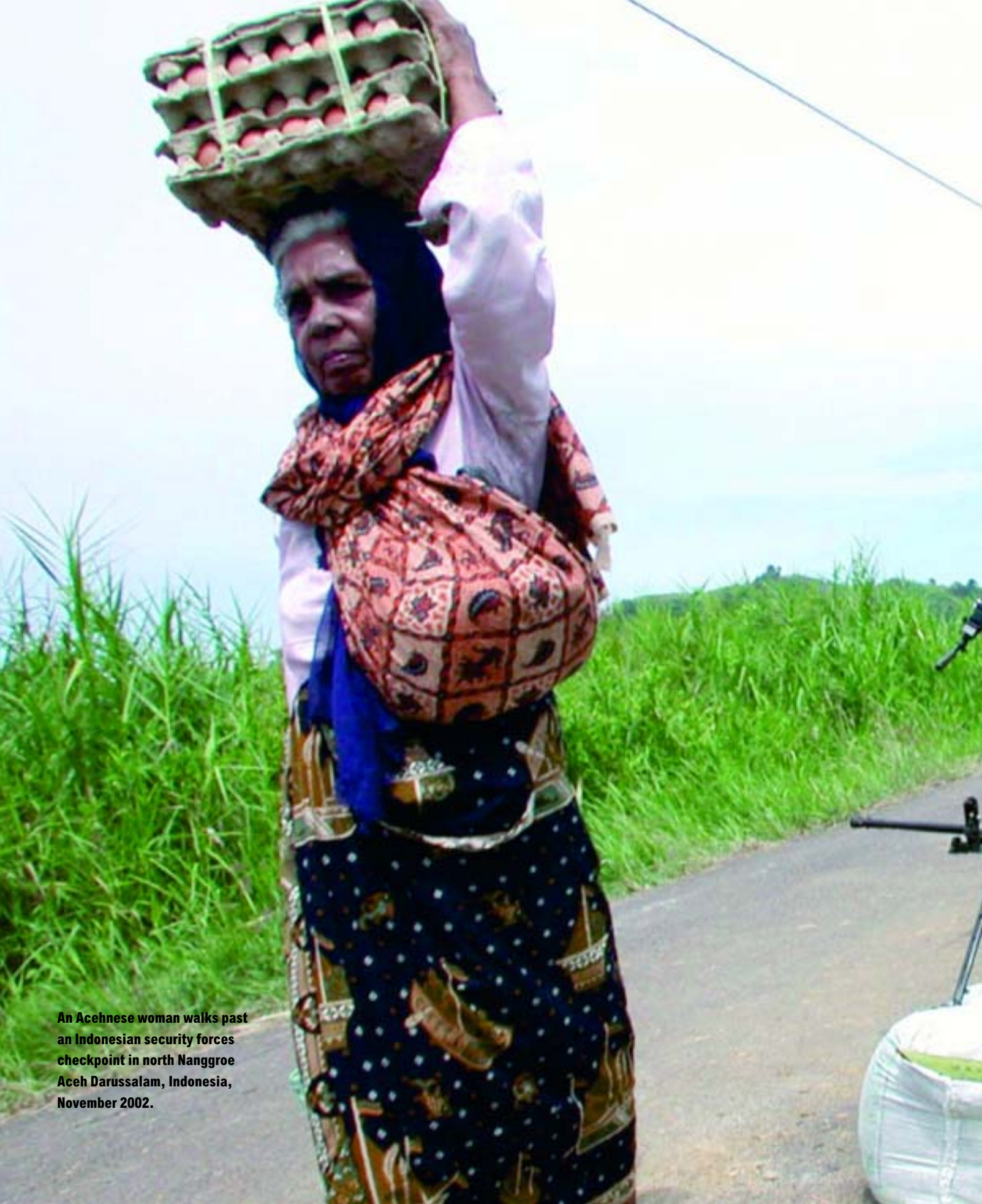
An Acehnese woman walks past an Indonesian security forces checkpoint in north Nanggroe Aceh Darussalam, Indonesia, November 2002.