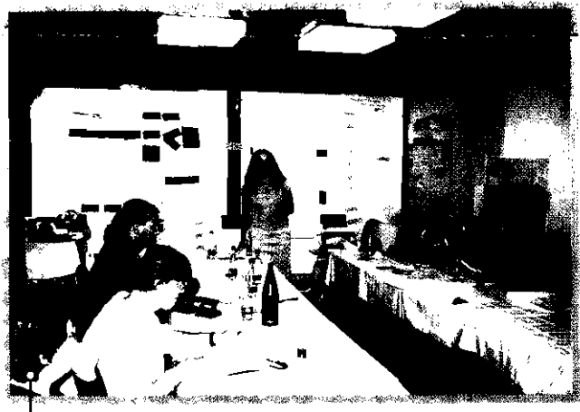
One of the trainings on human resources management

"I am a student at the Law Faculty in Skopje and for four months a member of the