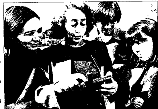
Thanks to the IT revolution, participants have easy, inexpensive access to GPS. (Participants in Close-up, page 20)