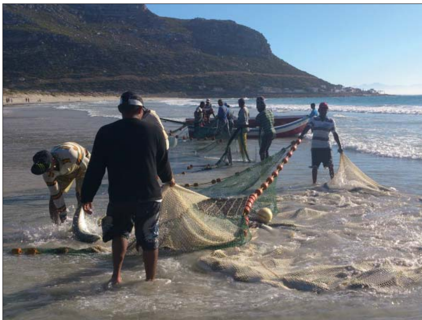
The day's catch being landed in Cape Town, South Africa. Many fisher people in the country have lost their livelihoods as a result of policies that are insensitive