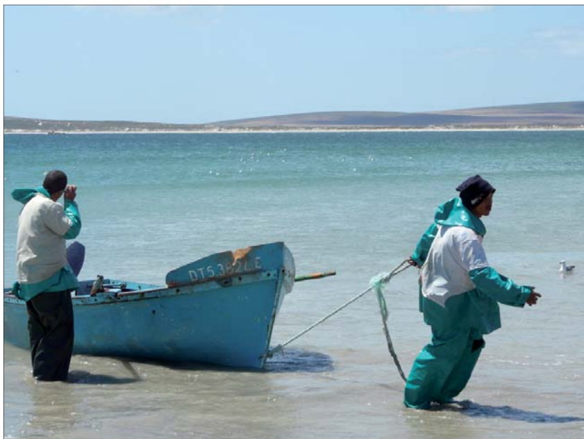
Small-scale fishers across Africa are becoming increasingly marginalized, both economically and politically

Guidelines to incorporate the views of the fishers, ultimately ensuring the protection of their human rights. We hope also that, as some consolation, small-scale fishers will be given a fair opportunity to comment on the draft policy reform document as it becomes available.